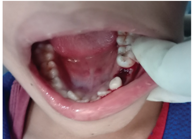
Fig. 5: Postoperative photograph

stumps irt 74 were removed atraumatically (Figs 4 and 5) followed by thorough irrigation of the socket with concentrated povidone iodine solution.