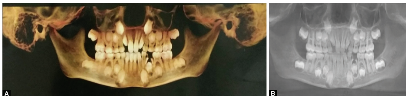
Figs 2A and B: (A) 2D-Cone beam computed tomography; (B) Orthopantomograph

Extraction of root stumps irt 74 was planned as soon as the patient reported back with the relevant documents after routine checkup. Critical attention was given to asepsis wherein all instruments were properly autoclaved before the use at 121^{\circ}\text{C} for at least 30 minutes by using saturated steam under at least 15 psi of pressure. Before starting the procedure, the patient was kept under antibiotic prophylaxis for infection control (cap amoxicillin 250 mg TDS \times 7 days) and povidone iodine (Betadine) was applied in the peripheral area around the oral cavity to maintain proper sterile work field. Inferior alveolar nerve block was administered to provide analgesia during the extraction procedure. Finally, extractions of root stumps were done using Straight Warwick James Elevator and mandibular root forceps (Fig. 3) and root