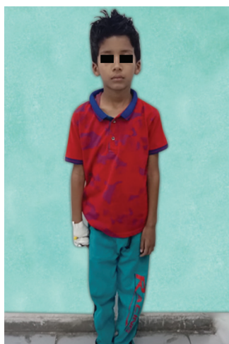
Fig. 1: Preoperative photograph