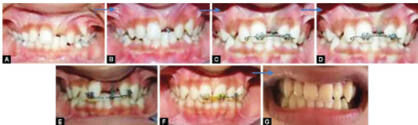
Figs 2A to G: (A) Pretreatment (B) Modified traction appliance in place (C) Open coil spring placed on 11 and 22 (D) Lingual button exposed, elastic thread attached (E) 0.22x0.028 in twin bracket with a McLaughlin Bennett Trevisi (MBT) on 11 and 22 and loop was incorporated and elastic thread attached (F) Tooth alignment done with e chain (G) Final tooth alignment

The 3D imaging technique provides the exact size and site of the mass and helps in surgical treatment planning. When more than three fourth of root is completed and the tooth does not emerge to oral cavity, it can be considered as impacted, especially if its antimeres has erupted more than six months ago. The longer the impaction time, the weaker prognosis is expected to be. 2 Evaluation of mechanotherapy possibilities to provide enough space and anchorage should be considered when forced eruption is planned. 3